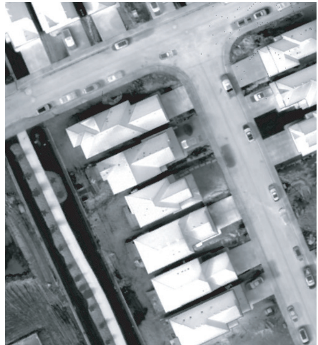
Radiometrically corrected and georeferenced microTABI thermal image