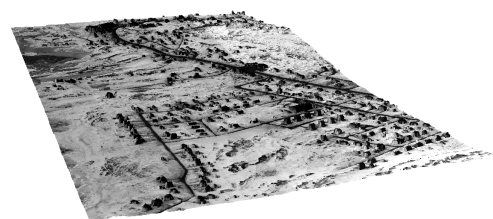
UVC-1800 imagery overlain on Lidar dataset